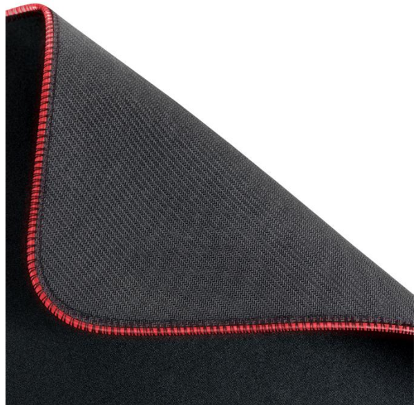
Non-slip Rubberized Base