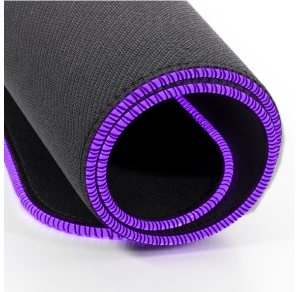
Soft body for maximum comfort